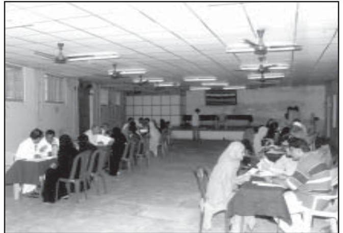
Interviews being conducted at Vijayawada